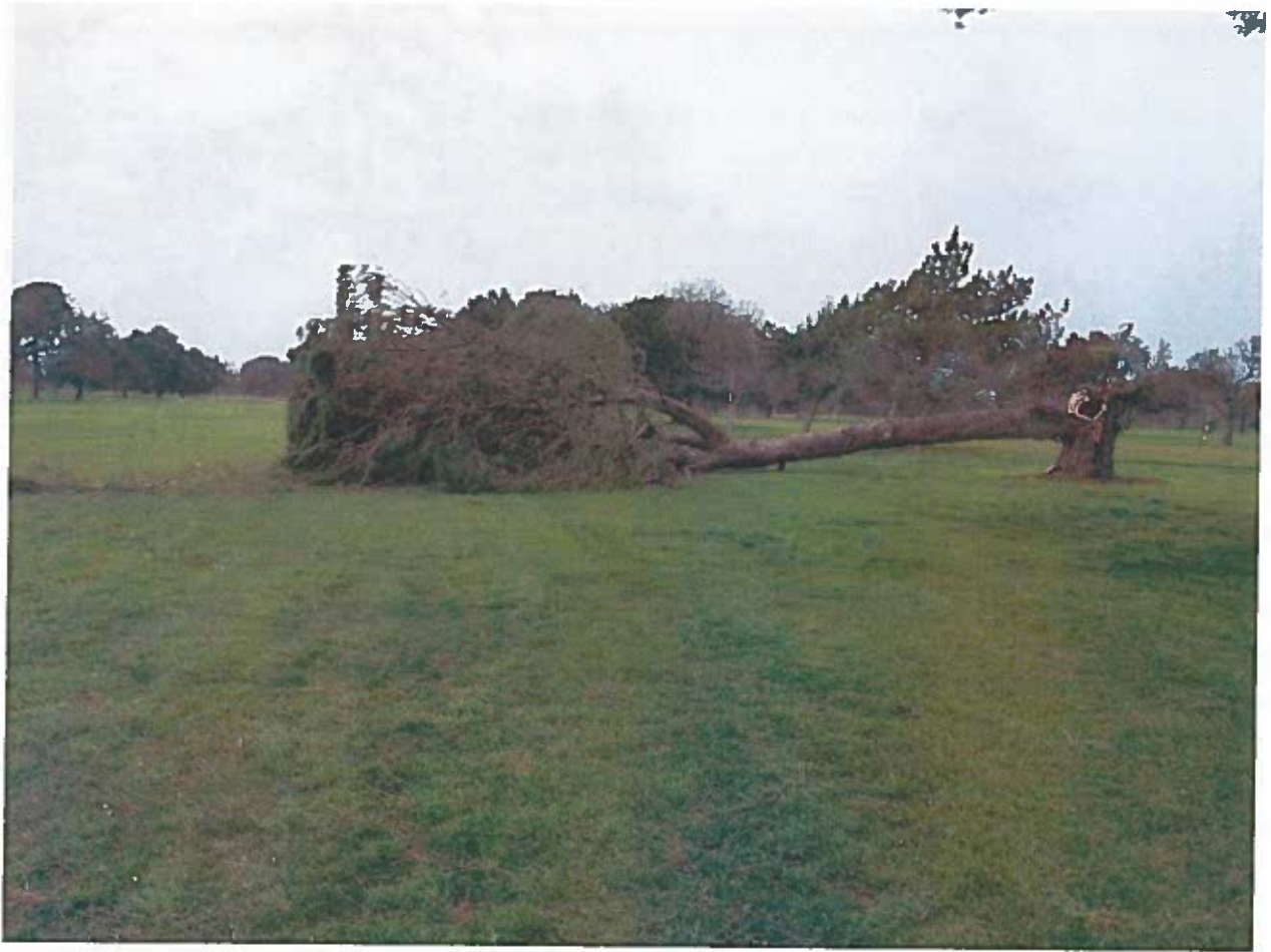
This Pine fell across Dryden 12 rough. Estimated cost of removal: $2,500