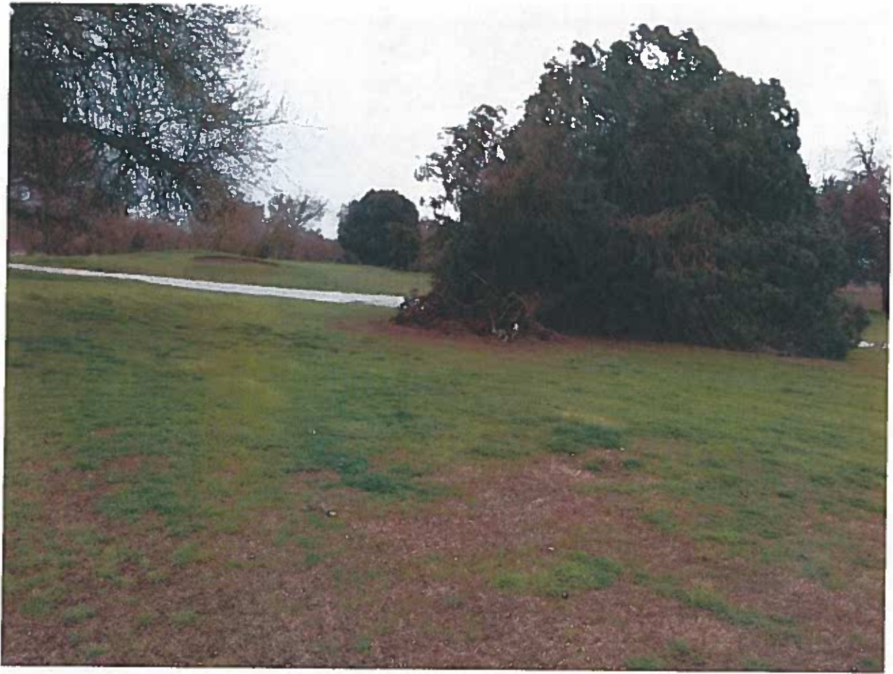
This big pine fell in Dryden 15 rough. Estimated cost of removal: $4,000