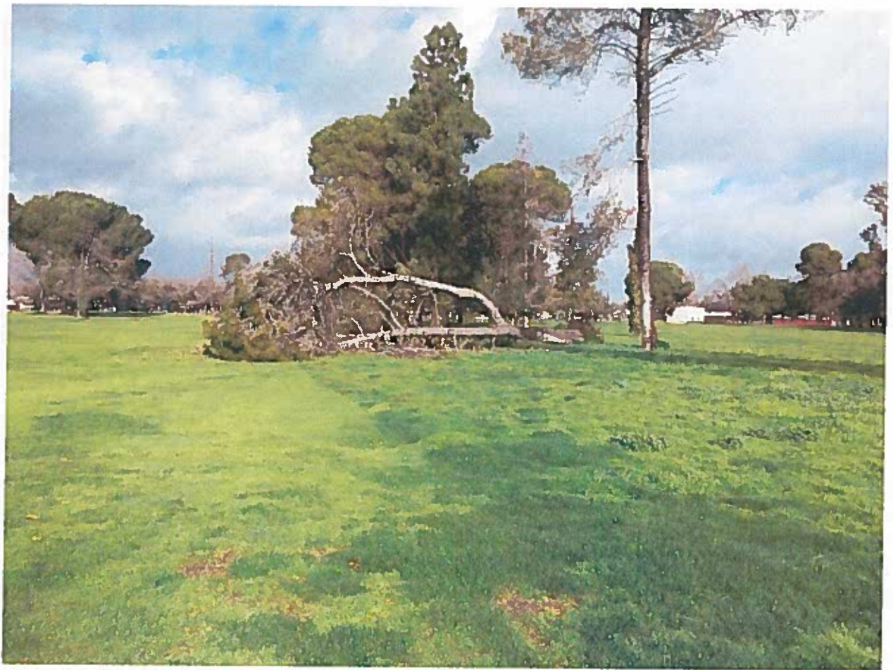
This pine is down at 4 Muni. Estimated cost of removal: $2,500.