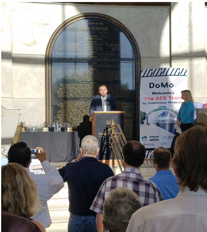
Assemblymember Adam Gray expresses his support for passenger rail service into Stanislaus County at an ACE Rail Celebration in June

Between 1990 and 2013, the number of people commuting from the northern San Joaquin Valley to the Bay Area more than doubled, growing from