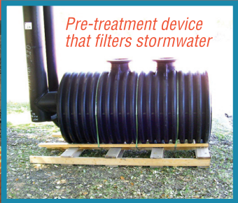
Pre-treatment device that filters stormwater