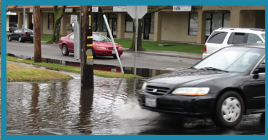
The previous stormwater system caused local streets to flood each time there was a significant rain event.

The City of Modesto has just completed construction on a new stormwater system with chambers that can hold 2.2 million gallons of water during a 100-year storm event. Stormwater first enters a pre-treatment device, gets filtered, and then percolates into the ground, recharging the aquifer at a rate of 7.7 million gallons per year!