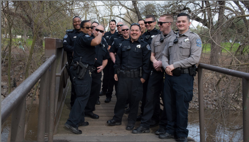
Beat Health Unit (BHU)