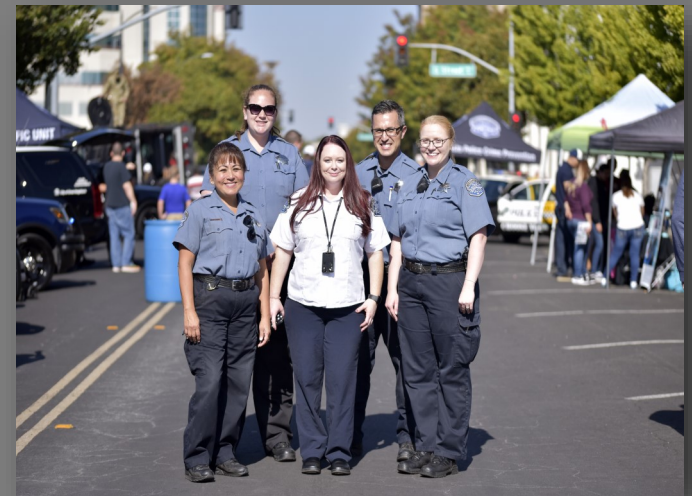
Crime Prevention Unit