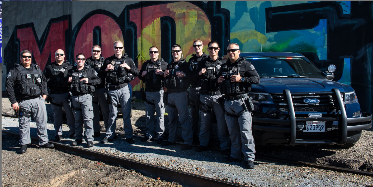
Street Gang Unit (SGU)