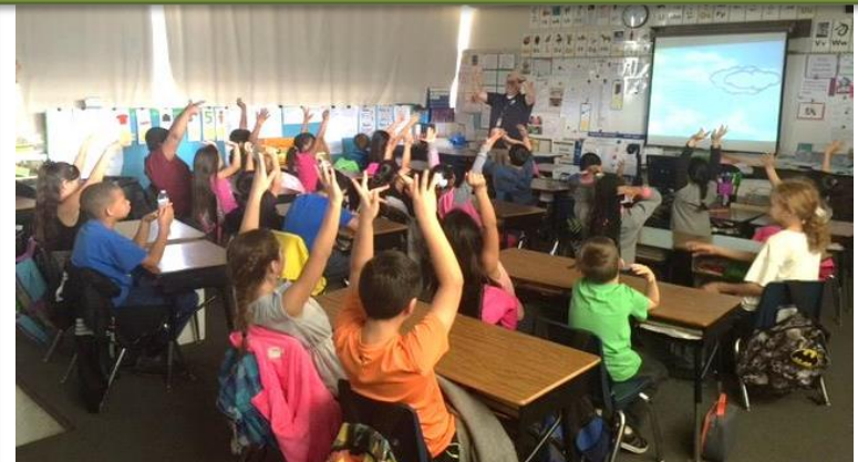
Water Conservation Program Elementary School Education