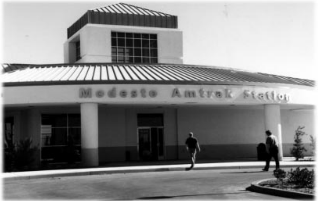
Right on track, Amtrak opens doors to train travelers on October 31, 1999.

Additionally, the City of Modesto will provide transit