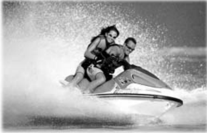
Jet skis and boats with standard two-stroke engines will have to be fueled with MTBE-free gasoline.

Remember, MTBE-free fuel is the only gasoline sold at the Modesto Reservoir and visitors are no longer allowed to enter the park with their own gas containers.